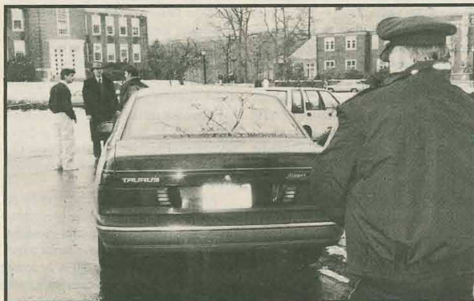
Friend or foe? A BCPD officer writes up a ticket near the chapel.