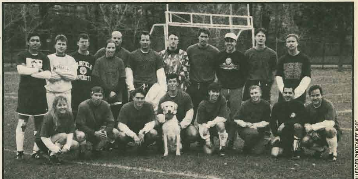
BCLS' championship soccer team.